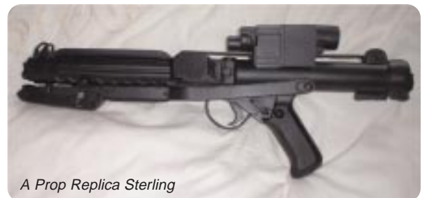
A Prop Replica Sterling