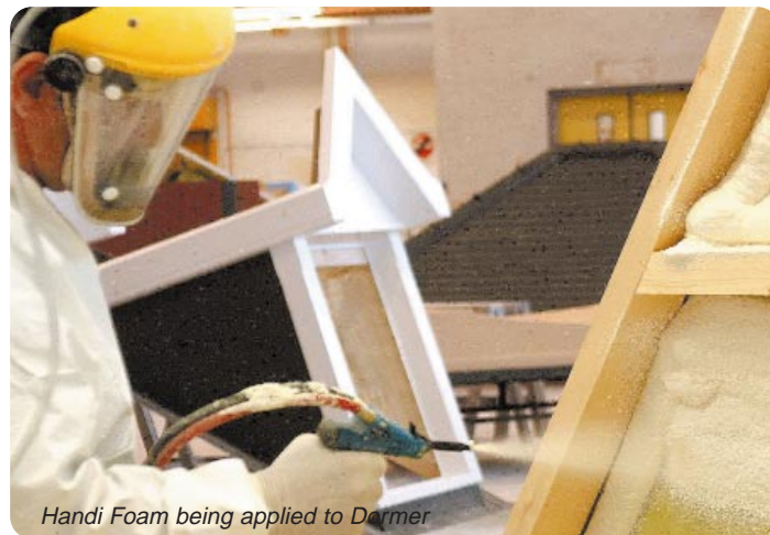
Handi Foam being applied to Dormer