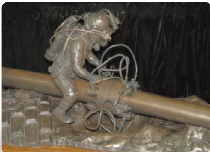
The finished boardroom statue Bolt Tensioning