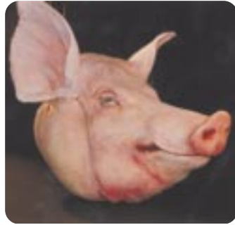
The SkinSil Pigs Head

effects props expert, rose to the challenge of producing the pig's head. "The SkinSil was fantastic. It's very easy to work with if you are well prepared, as it does set quickly. As long