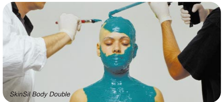
SkinSil Body Double