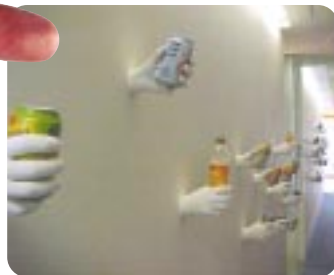
The Wall of Hands

A nyone paying a visit to Cadbury Schweppes' offices at Watford will not have failed to notice a particularly unusual feature in the main reception. The eye catching "wall of hands" was created by Oyster Products and features life size hands which are firmly grasping a wide variety of well known brands from the company. "Our usual line of business is mostly shop interiors, fit-outs and offices but this was something a bit