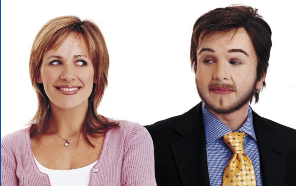
Carol & "Jeff"

Who's that guy with TV presenter Carol Smillie? Well, we are all supposed to have two sides to our personality and Carol's other half "Jeff" is... Carol Smillie! The special prosthetic make-up was constructed for 5's "Gender Swap" programme using Bentley's SkinSil and silicone elastomers. The programme transforms the gender of well known personalities with the help of leading special effects experts, and then puts them into real life situations to see if they can successfully act out their new personalities before unsuspecting members of the public. SkinSil has been used by the make-up team because of its superior technical performance and time saving properties.