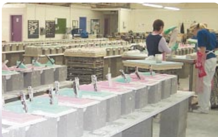
Production of Easter Island statues

So far over 8,000 pieces have been produced with Bentley supplying all the moulding materials and over 175 tonnes of Matrix C.